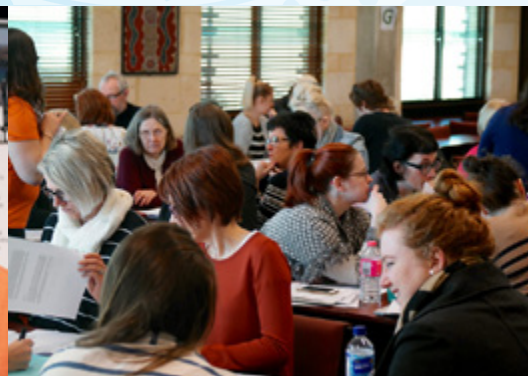
HTAA PL at Notre Dame University